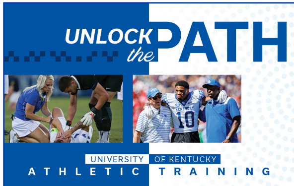
Artwork / Front