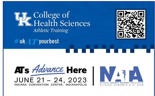
Artwork / Back