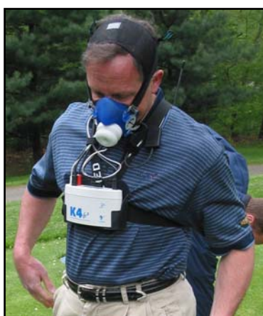
Figure 1. Golfer wearing portable metabolic testing equipment.

The subject was fitted with a portable telemetric metabolic system (K4b 2 , Cosmed USA) integrated with a heart rate monitor (S210, Polar USA) to measure the physiological responses of oxygen uptake, heart rate, respiratory exchange ratio, and caloric expenditure. The metabolic system included an open-circuit respiratory mask connected to a gas analyzer. The gas analyzer and battery pack were worn in a harness on the chest and back of the player (see Figure 1). An integrated body monitoring system (Sensewear Armband, Body Media) was used to capture total walking distance for each round and was worn on the mid triceps region of the right arm. All equipment was calibrated before and after each round according to manufacturer's guidelines.