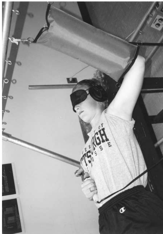
Figure 1 Threshold to detect passive motion test on the PTD.